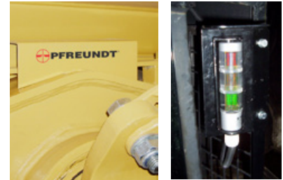
2 Measuring element DW-3 with LED signal lights for loading status