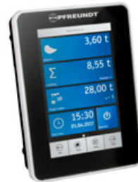
1 Weighing electronics