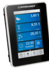
1 Weighing electronics