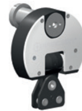
2 Measuring element ASK-2