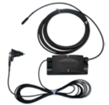
3 Radio modul